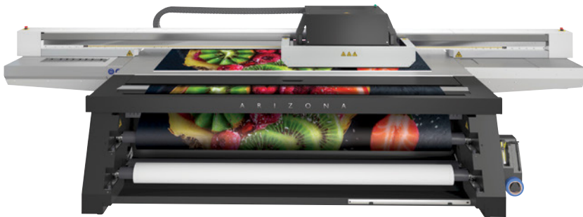
Océ Arizona 1300 Series Printer

DO IT NOW: No warm up required. The instant-on capability lets you start printing immediately.